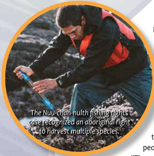
The Nuu-chah-nulth fishing rights case recognized an aboriginal right to harvest multiple species.